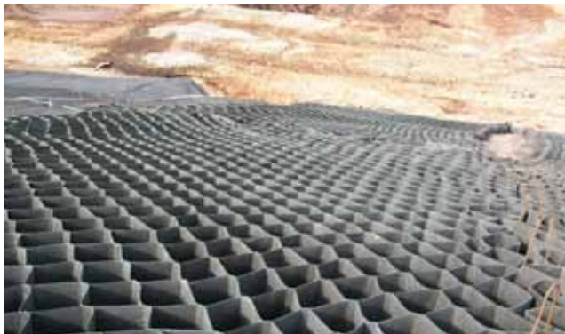
Geocell panels positioned and fixed prior to filling