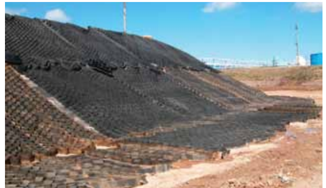
Geocell panels positioned and fixed prior to filling