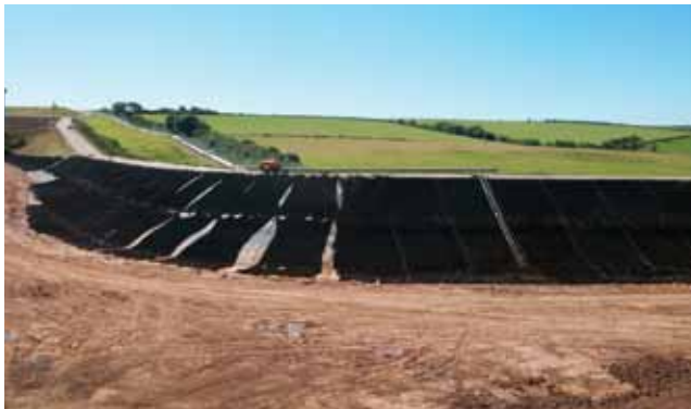
Geocell Panels positioned prior to fixing

Project: Milford Haven Oil Refinery Client: Murco Contractor: Quantum Great Britain Limited, Product: TERRAM™ Geocell 25 /15 (modified to take tendon suspension)