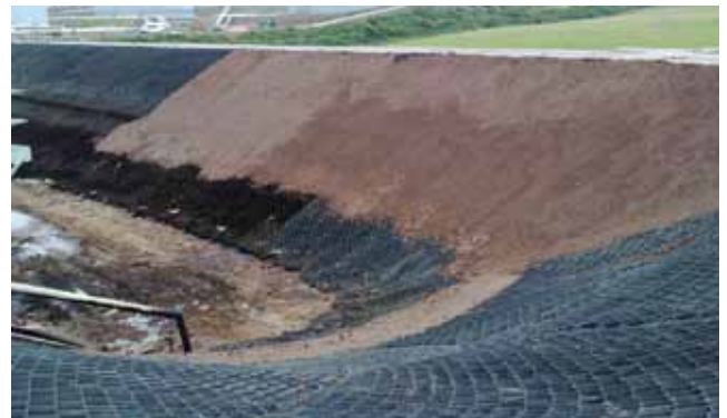
Geocell panels infilled with selected graded top soil.