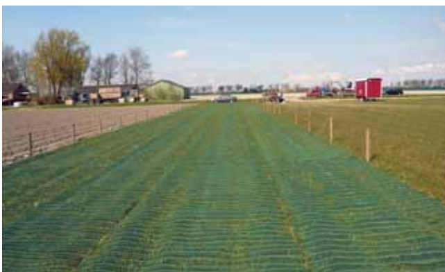
GRASSPROTECTA installation for car parking

GRASSPROTECTA mesh can also be installed onto newly-landscaped areas and seeded as required. It is strongly advised that newly-installed areas remain untrafficked until the sward and the mesh have knitted - normally after a few weeks during the growing season, increasing to a few months out of season. Immediate use may restrict growth and limit the effectiveness of the installation.