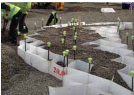
Terram Geocells, 220mm x 220mm, 3m x 6m panels, first layer