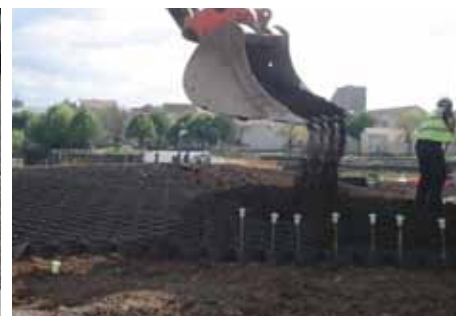
Terram Geocell 250mm x 150mm, 7m x 5m panels

A PGI Company • Fiberweb Geosynthetics Ltd. Blackwater Trading Estate • The Causeway Maldon • CM9 4GG • United Kingdom Tel: +44 (0) 1621 874200 • Fax: +44 (0) 1621 874299 e.mail: info@terram.com • www.terram.com