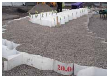
Terram Geocells, 220mm x 200mm, 3m x 6m panels, second layer